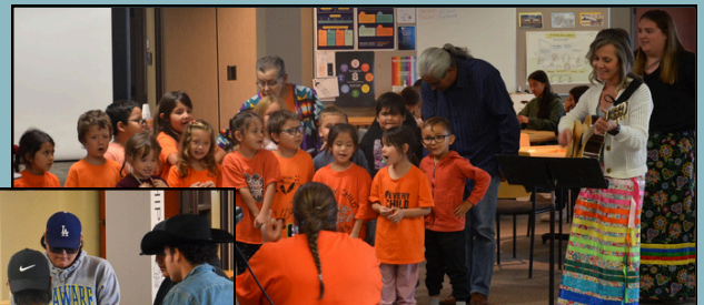
Michif Early Learners from Stobart Community School