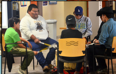
SkyBoyZ drumming group from Stobart Community School