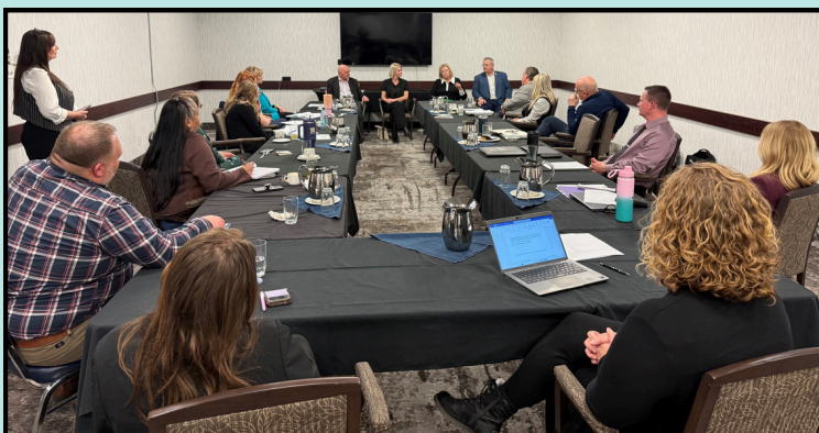
The Prairie Spirit Board of Education met with the four MLAs for an engaging conversation about effective advocacy with the provincial government.