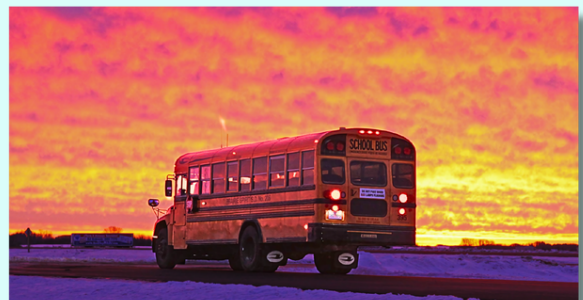
A Prairie Spirit bus pulling into Clavet Composite School.

Prairie Spirit's Transportation Services Department is recognized by SGI for its excellent training and safety record.