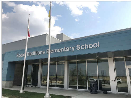
All signage at École Traditions Elementary School is in both English and French

French Immersion programming at École Traditions Elementary School in Warman will expand to include Grade 2, starting this fall. The Prairie Spirit Board of Education approved the program expansion at its meeting on January 7. École Traditions Elementary currently offers French Immersion for Kindergarten and Grade 1 students. This year, there are 28 Kindergarten students and 18 Grade 1 students in the school's French Immersion program.