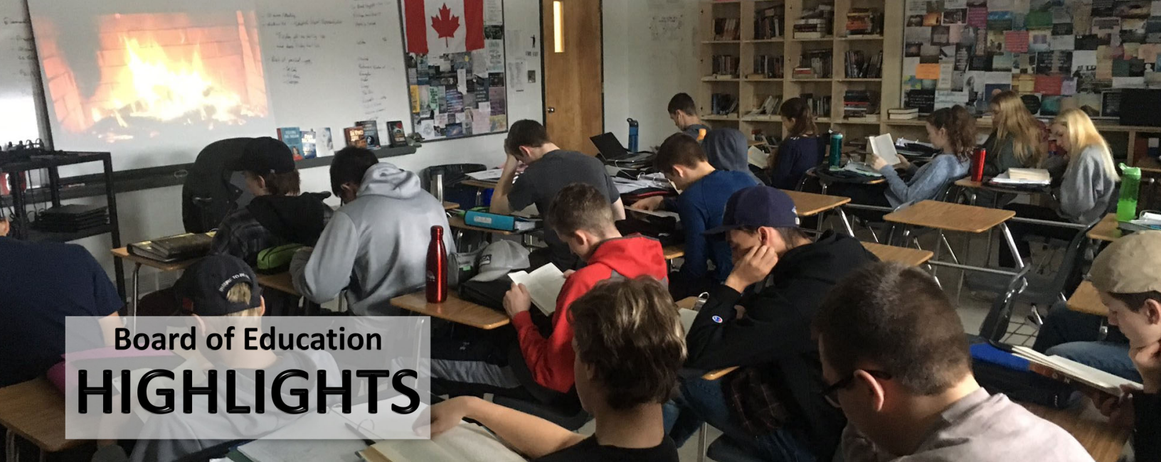
Delisle Composite students reading by the "fire" in early January.