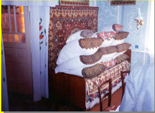
The beautiful embroidery inside village homes