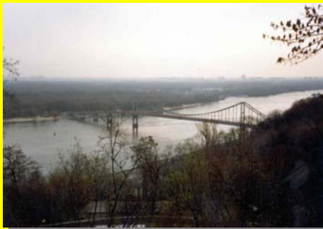
The mighty and powerful Dnipro River