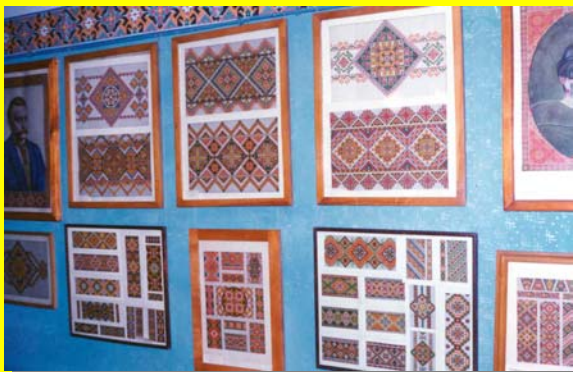
The Haras Museum of Ukrainian embroidery in Vyzhnytsia