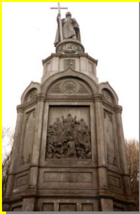
The monument to St. Volodymyr overlooking the Dnipro River