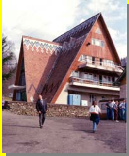
The rustic charm of the chalet at Nimchych