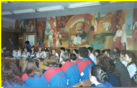
Answering questions about Canada