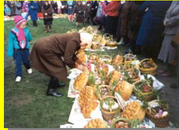
Traditional Easter celebrations