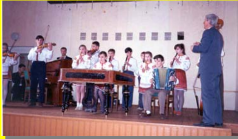
Musical performances given by students