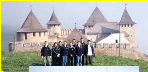
The fortress at Khotyn, on the banks of the Dnister River