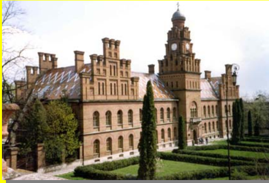
The beautiful Yuriy Fedkovych National University in Chernivtsi