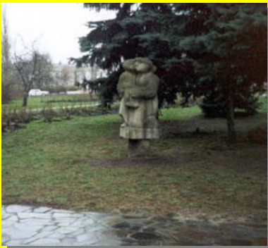
'Kamiani' or stone babas, dating back to the time of the Scythians (8th -3rd cent. BC)