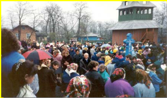
The crowds of villagers who attend church at Easter