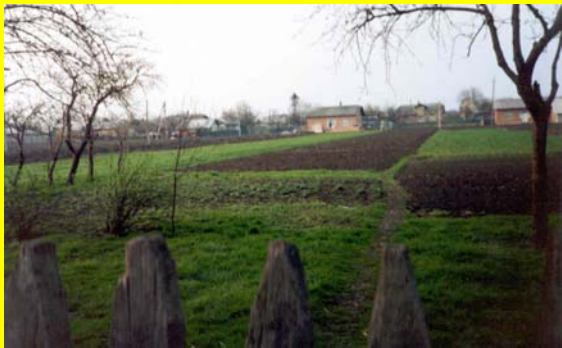
The village landscapes and large backyard gardens